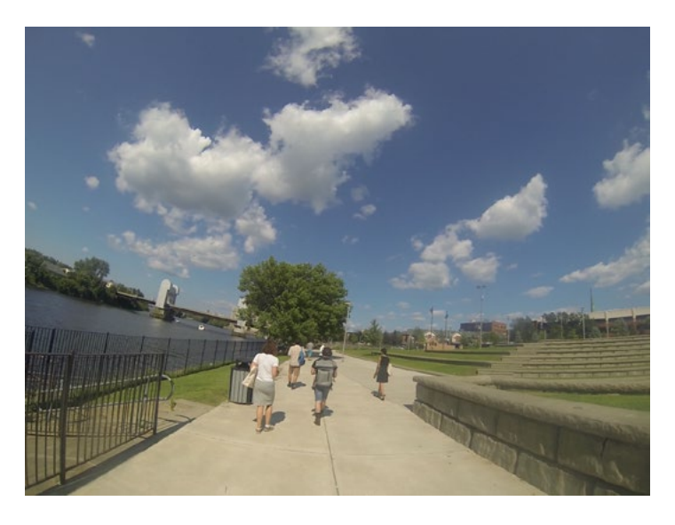
Figure 4. Participants listening to local mythology as they walk along the river as part of the Riverfront Park Soundwalk (Summer 2016).

The final restructured version of the Riverfront Park Soundwalk also overall gave long-term residents who participated in the soundwalk a refreshed connection to the river: "Informative, ended at a perfect location—the water fountain—on a hot day. I enjoyed hearing some of the history and context of the river that I have walked along for the past ten years, and deeply moved by its native mythology." This participant said "Yes" to feeling more connected to this particular environment due to the soundwalk, and the memory of the Native American tribes person jumping off of the falls will be remembered at every visit to the river.<sup>5</sup>