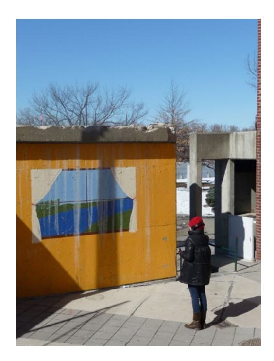
Figure 3. Participant listening to Troy, NY's Native American history through the lens of a forgotten mural as part of the Riverfront Park Soundwalk (Winter 2015).

The final restructured version of the Riverfront Park Soundwalk also overall gave long-term residents who participated in the soundwalk a refreshed connection to the river: "Informative, ended at a perfect location—the water fountain—on a hot day. I enjoyed hearing some of the history and context of the river that I have walked along for the past ten years, and deeply moved by its native mythology." This participant said "Yes" to feeling more connected to this particular environment due to the soundwalk, and the memory of the Native American tribes person jumping off of the falls will be remembered at every visit to the river.<sup>5</sup>